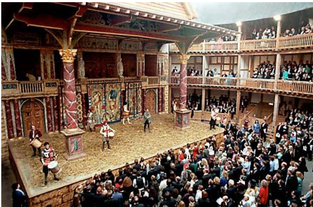
A view of the stage of the rebuilt Globe as it stands now, London, England.